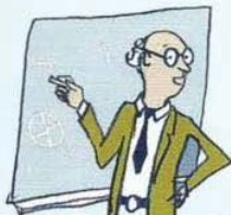
1 a teacher

a doctor a nurse a student a teacher a shop assistant a bus driver a businessman a police officer a builder